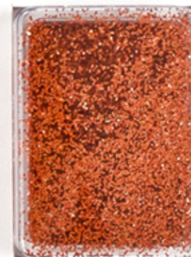
2510A-471-L Bright Copper