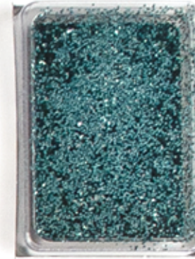
2510A-5477-L Dark Green