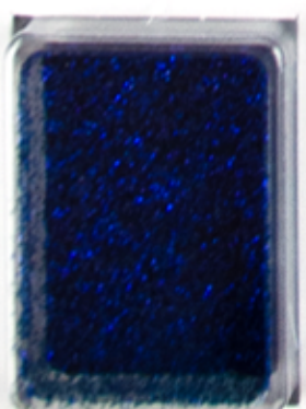
2510IR24-2738-L Denim Blue