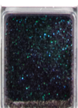
2510IR23-282-L Dark Ocean