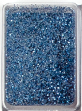
2510A-284-L Sky Blue