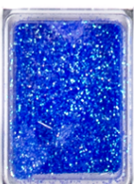
2510IR22-279-L Royal Blue