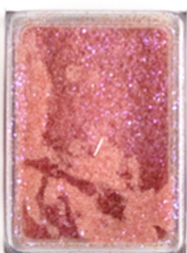
2510IR24-257-L Pink Grapefruit