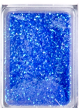
2510IR22-2727-L Bright Sky