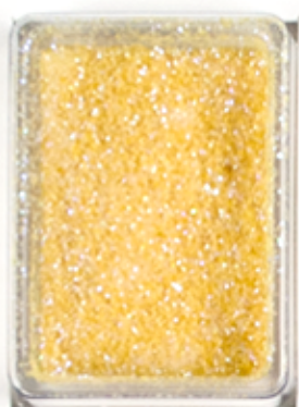
2510IR23-156-L Golden Yellow