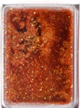
2510IR22-484-L Dark Salmon