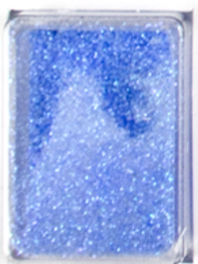
2510IR23-2777-L Ice Blue