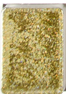
2510A-4515A-L Lemon Grass