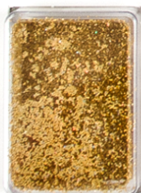
2510A-730A-L Victorian Gold