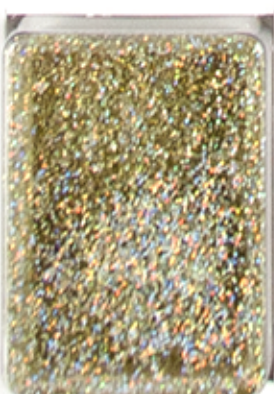
2510A-4505A-L Olive Green