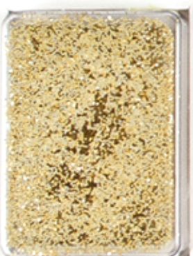
2510A-465-L Glorious Gold