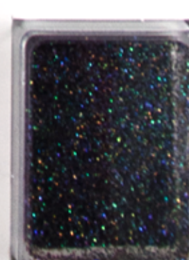
2510IR00-432-L Multi Black