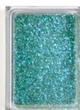
2510IR23-5493-L Jungle Green