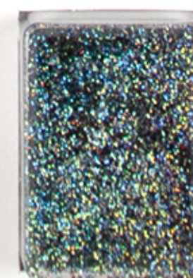
2510A-5487A-L Pine Green